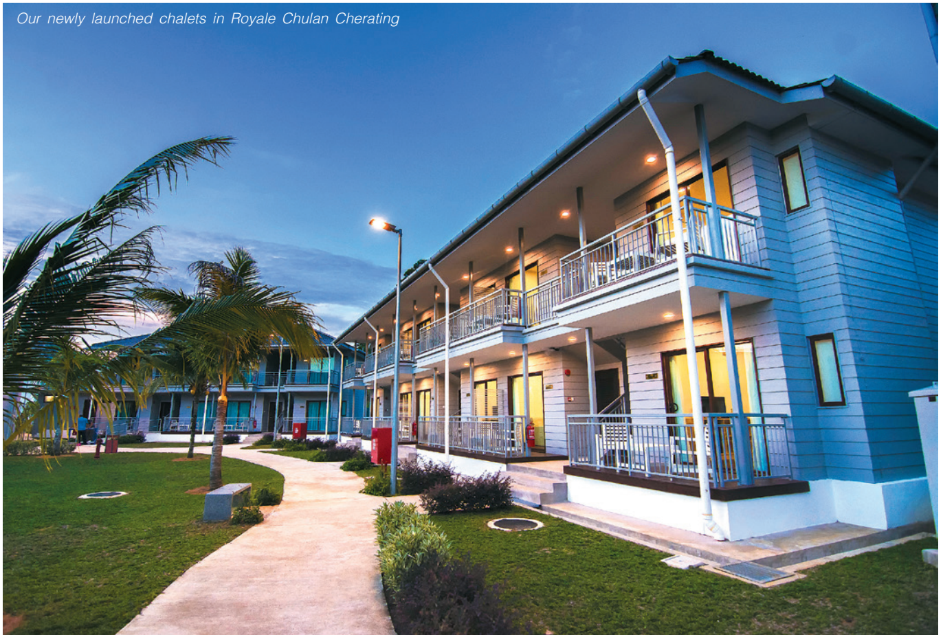
Our newly launched chalets in Royale Chulan Cherating